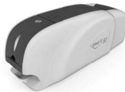
Dual sided ID CARD PRINTER smart-31D