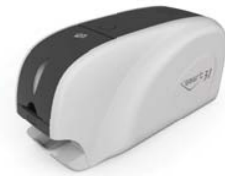
Rewritable ID CARD PRINTER smart-31R